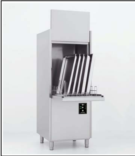
Accessories not included