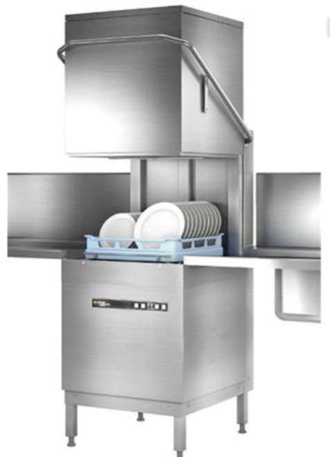
Benches etc not included