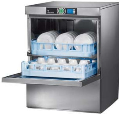
** Shown with optional double rack insert